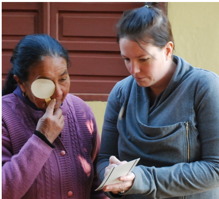
Mission Trip 2019

We are thankful for the opportunity to once again visit our friends and partners at CMB and UCMB. We invite you to support the mission trip in these ways: