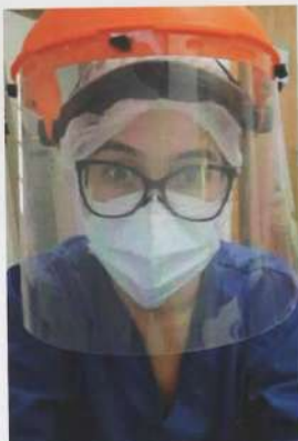
Maria Elena General Hospital Luque Paraguay

These are some of the UCMB nurses who are working in the Covid-19 units throughout Paraguay, Argentina and Spain. These nurses all received scholarships from PBMCF. They would welcome your prayers for continued divine guidance and protection. Thank you to our donors who helped these nurses when they were students.