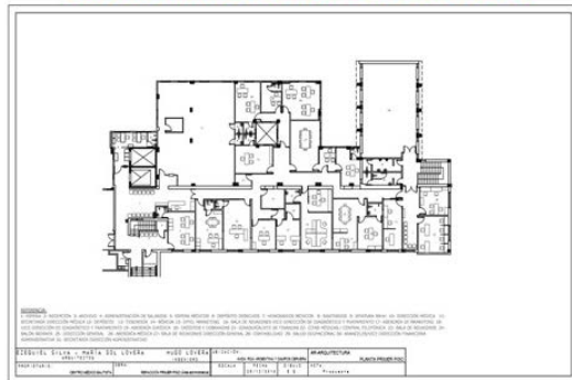
PLANO PRIMER PISO - PROPUESTA.